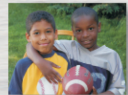
Ask about our Party Packages!