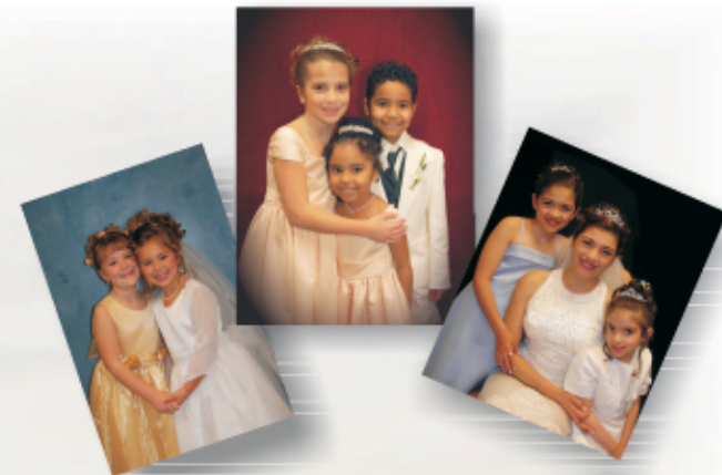
With our Complete Portrait Package